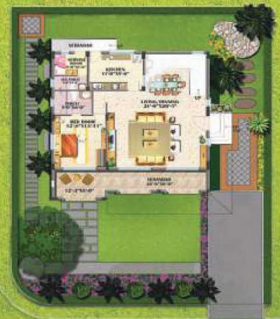
Ground Floor Plan with Landscape