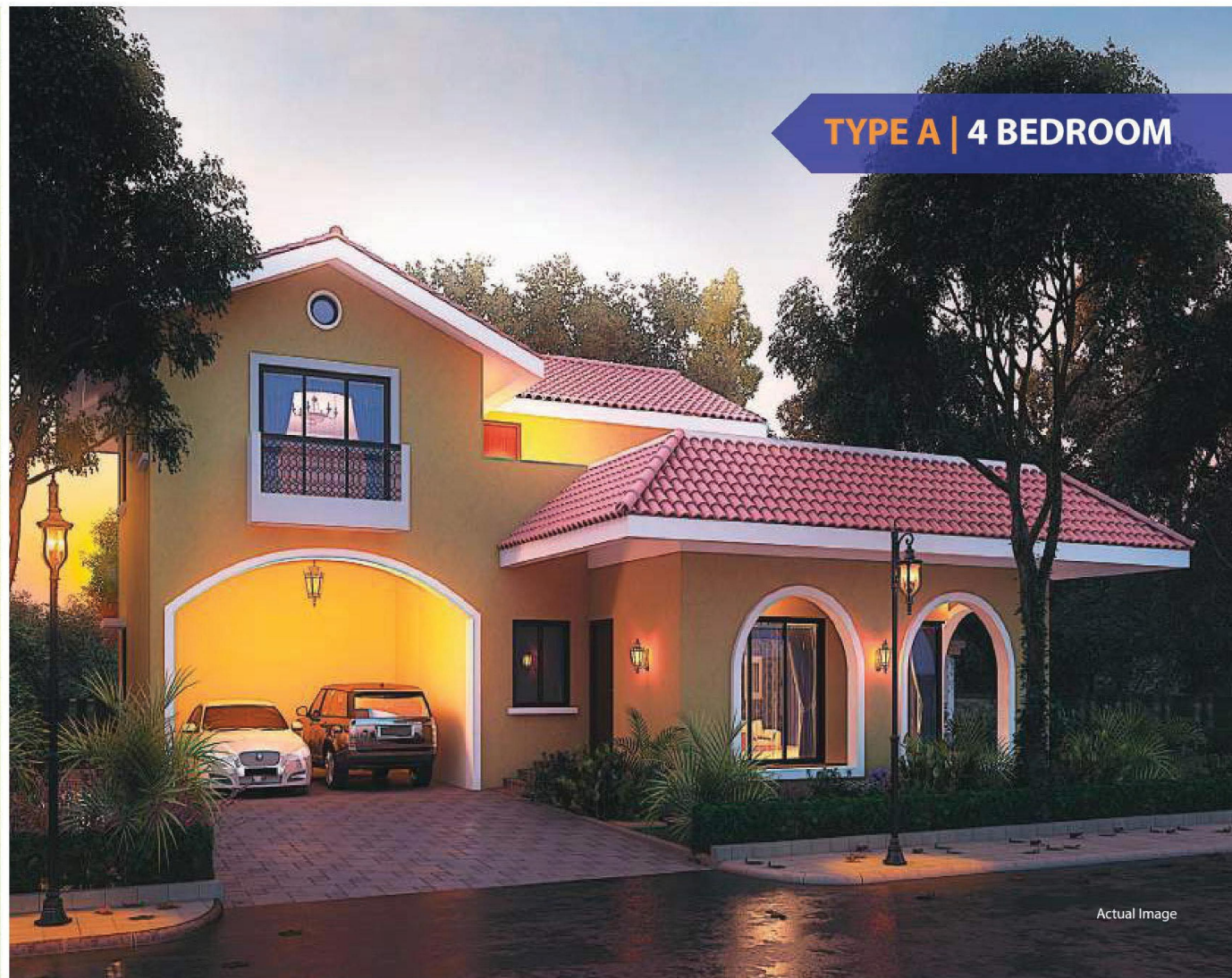
TYPE A | 4 BEDROOM