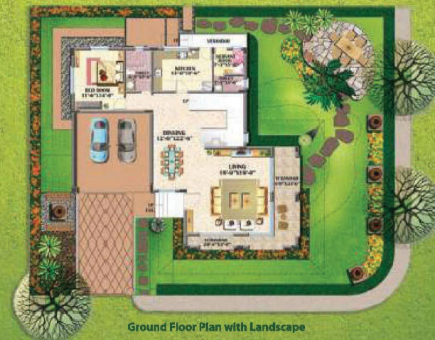
Ground Floor Plan with Landscape