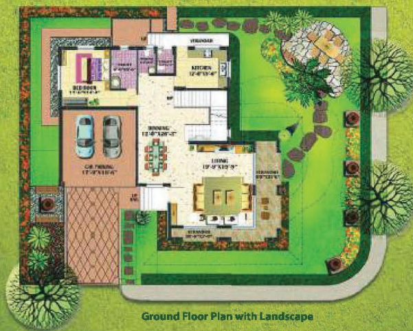
Ground Floor Plan with Landscape